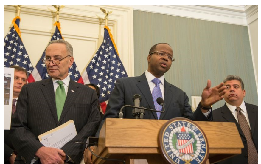
U.S. Senator Charles Schumer (left) with DA Ken Thompson (middle) in Washington D.C.

This case has brought national attention to this gaping hole in our country's airport security. Presently, airport employees, such as baggage handlers and ramp workers, are not required to go through TSA checkpoints when moving in and out of the airport. Following the announcement of the Brooklyn District Attorney's airport gun trafficking investigation, tremendous headway has been made in correcting this security deficiency.