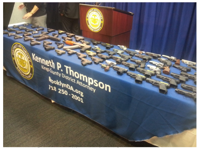
Guns recovered from another VCE investigation

In addition to this aggressive prosecution of gangs, the DA's office has also targeted narcotics trafficking conducted in Brooklyn housing